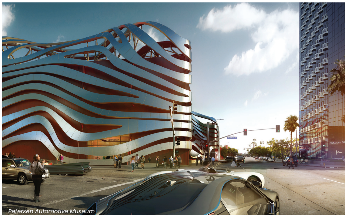
Petersen Automotive Museum