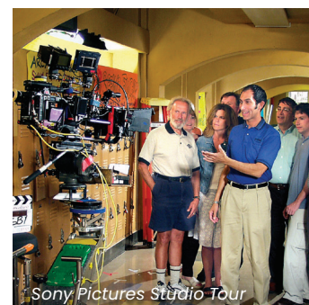
Sony Pictures Studio Tour