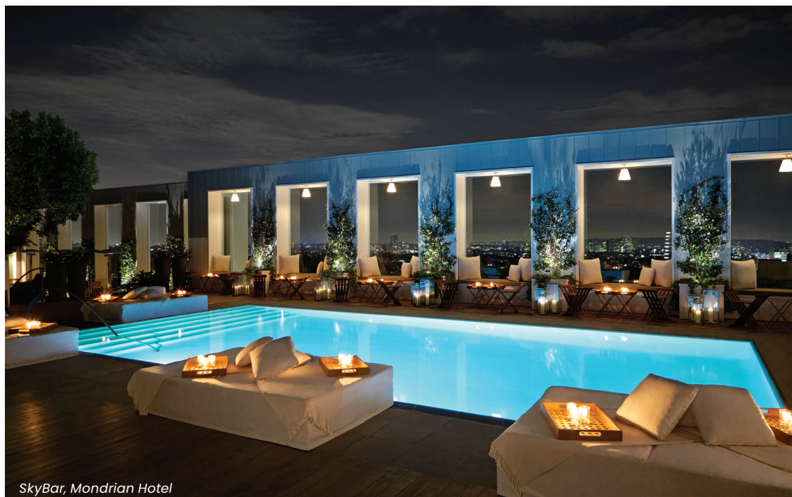
SkyBar, Mondrian Hotel