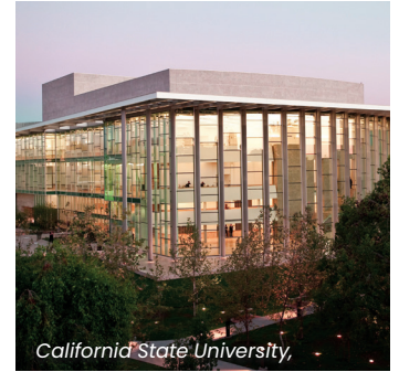
California State University, Northridge