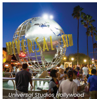
Universal Studios Hollywood