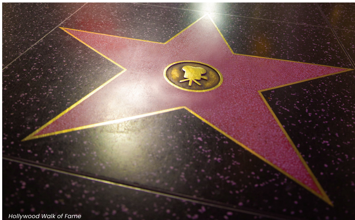
Hollywood Walk of Fame