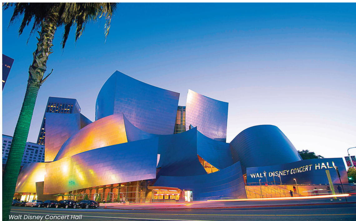
Walt Disney Concert Hall