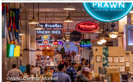
Grand Central Market