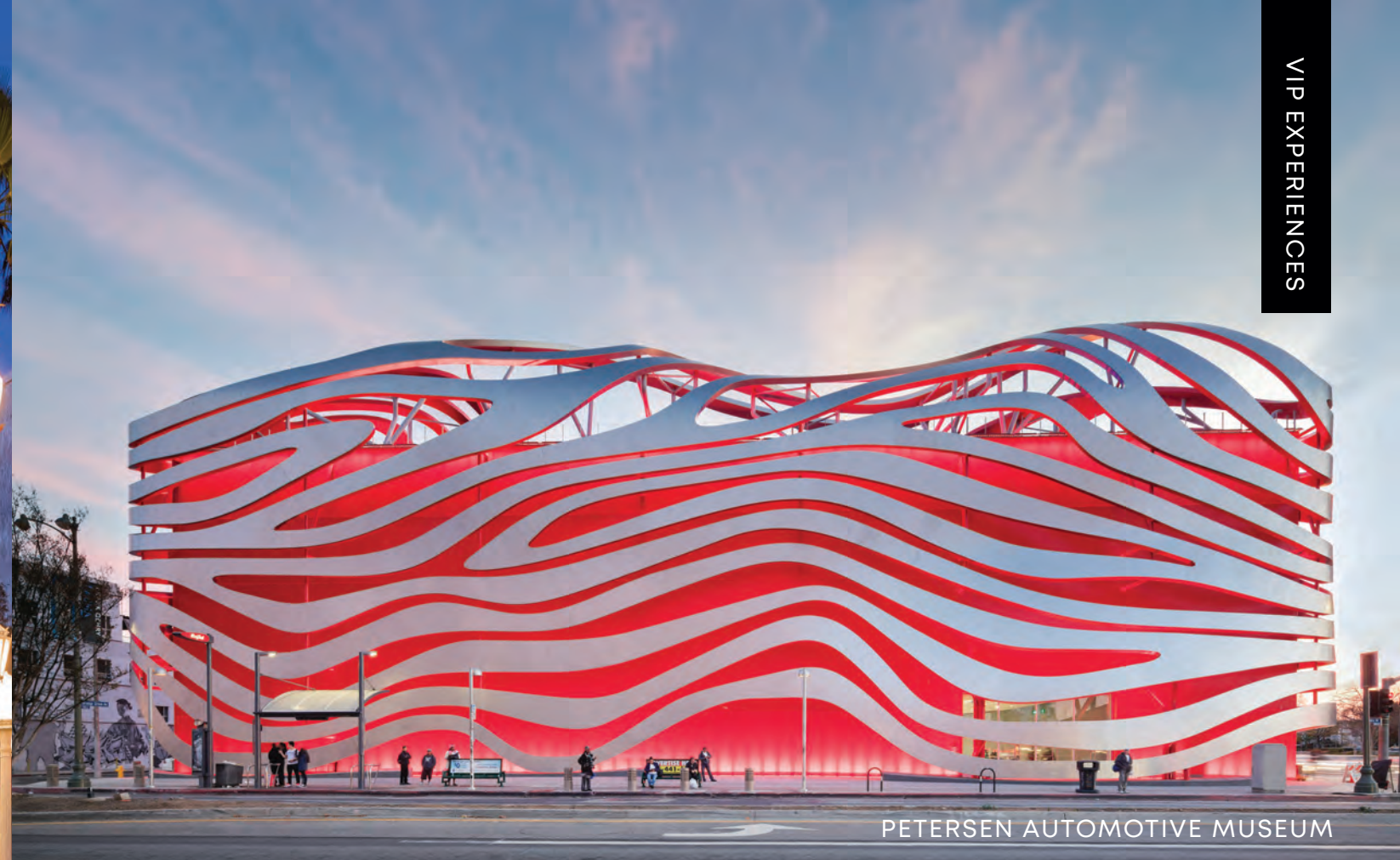
PETERSEN AUTOMOTIVE MUSEUM