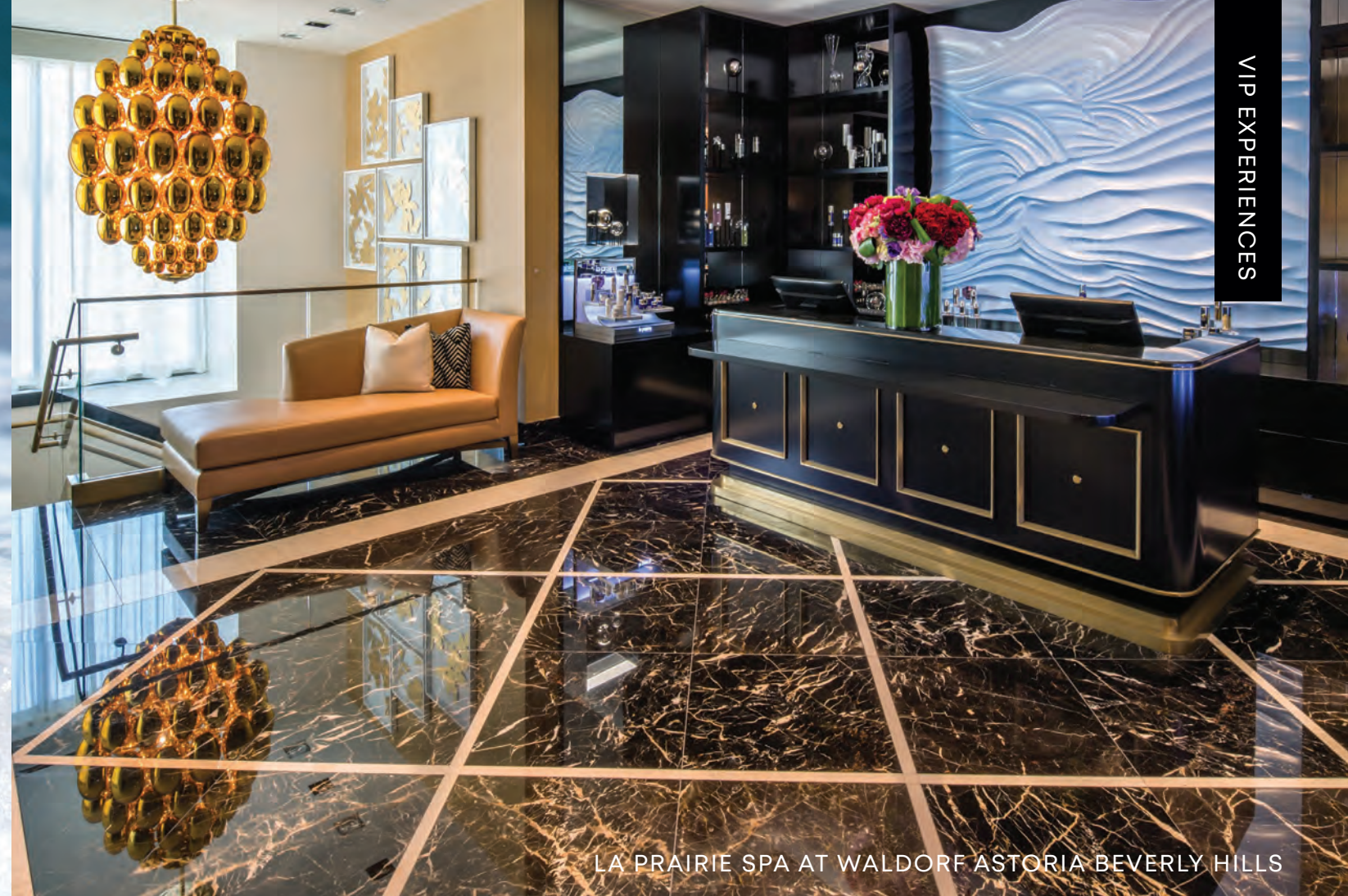
LA PRAIRIE SPA AT WALDORF ASTORIA BEVERLY HILLS