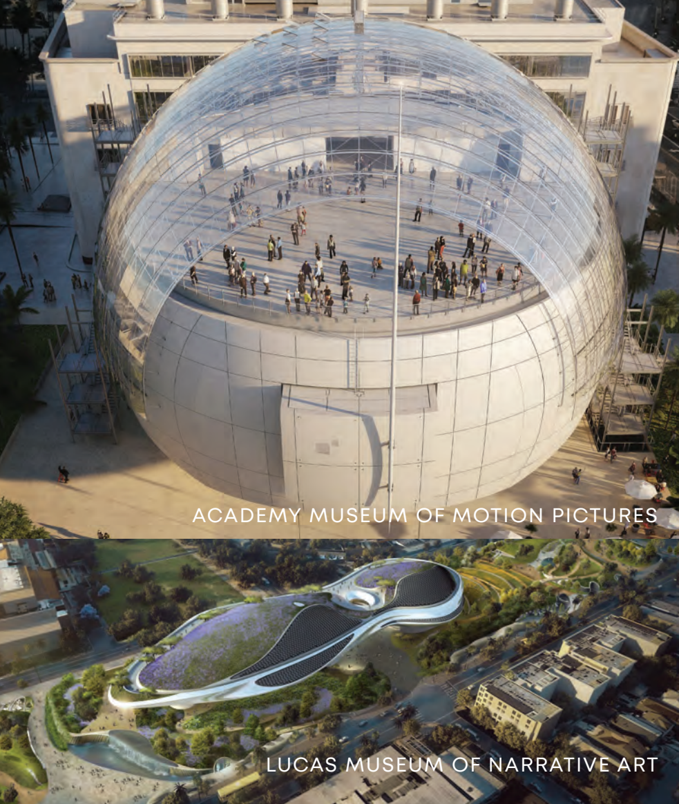
ACADEMY MUSEUM OF MOTION PICTURES

Expansive swaths of space and unlimited ingenuity spur the creative minds in Los Angeles to continually broaden the city’s artistic and cultural offerings. Here are three of the most recent and exciting examples.