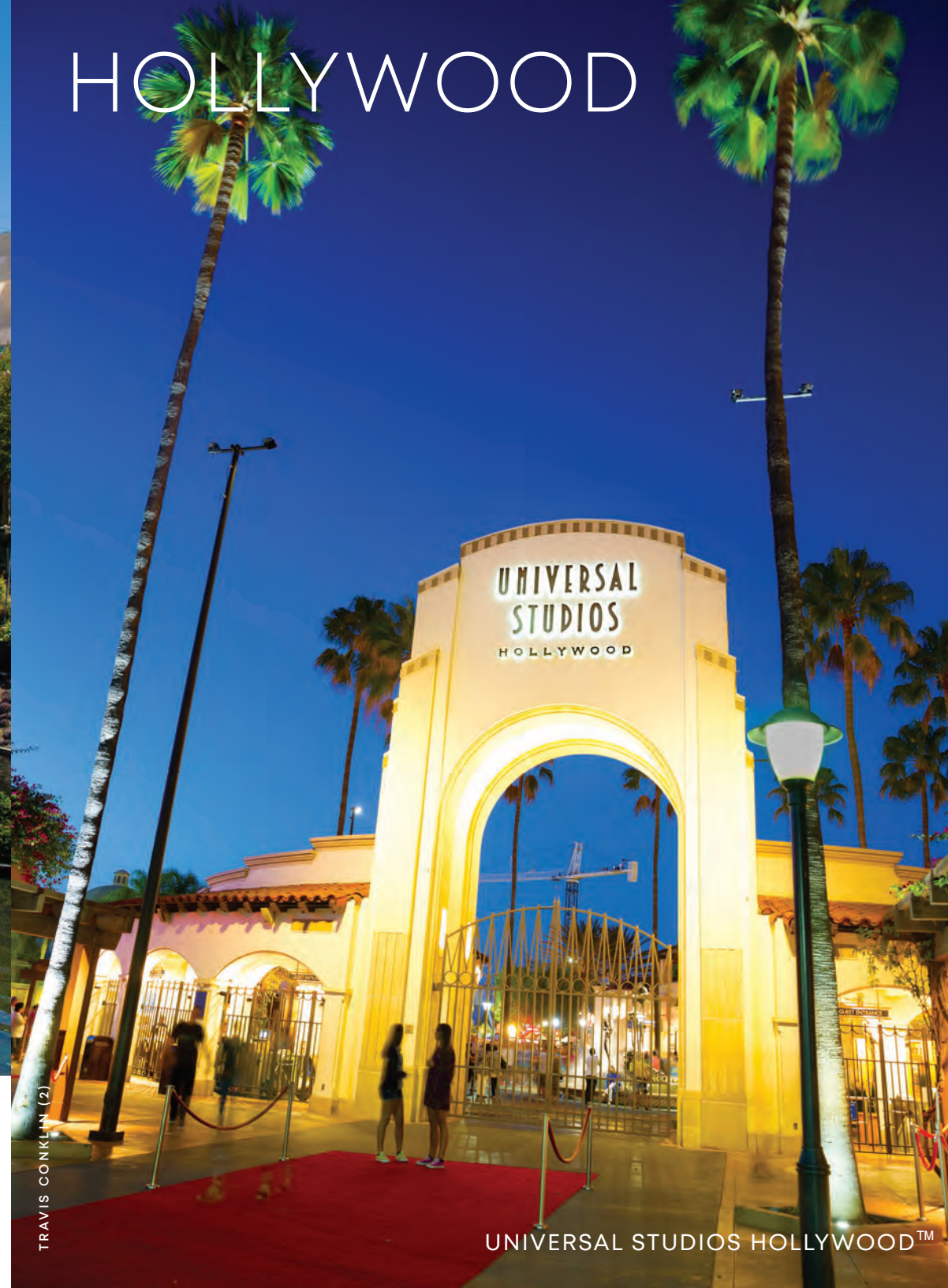
TRAVIS CONKLIN (2)