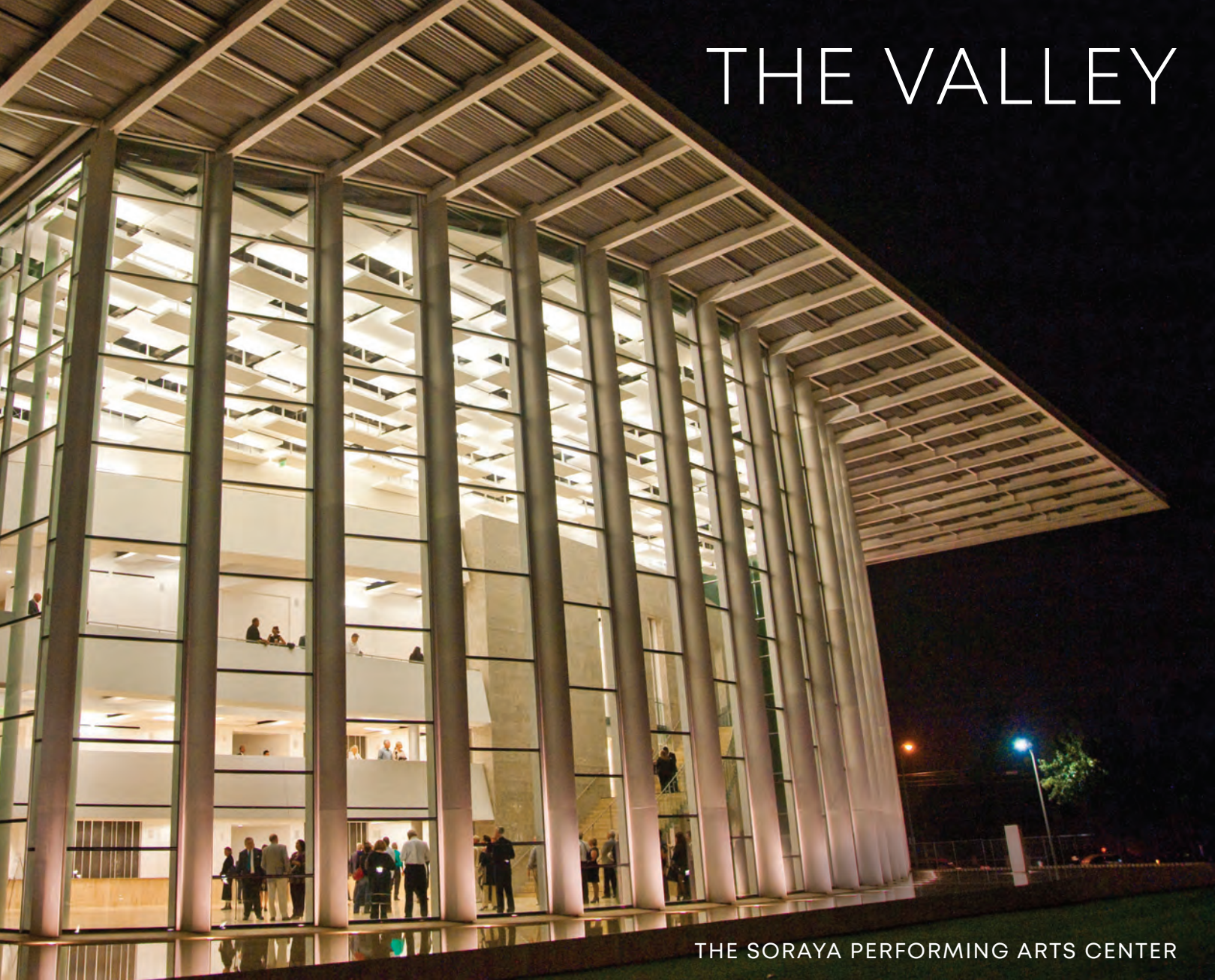
THE SORAYA PERFORMING ARTS CENTER