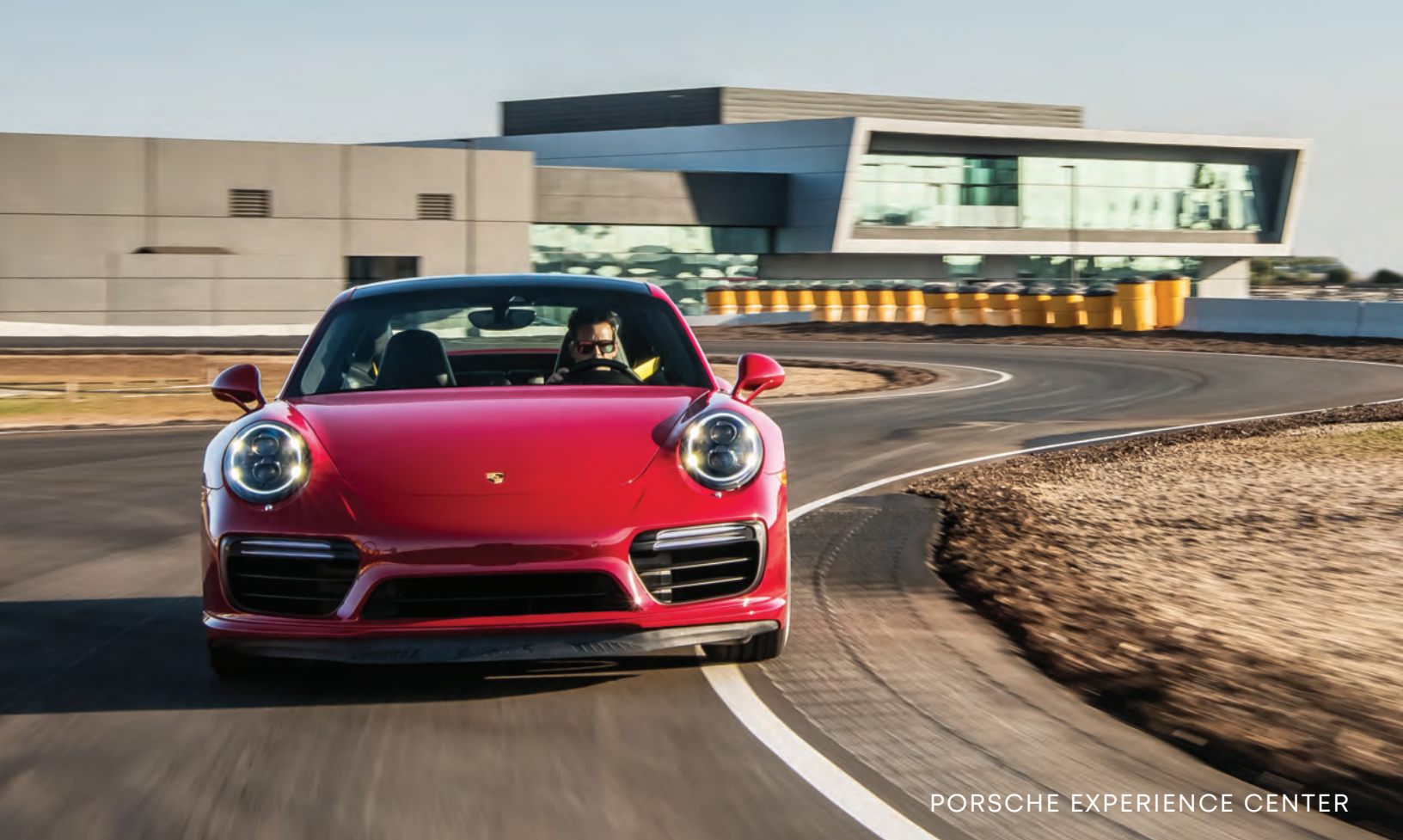
PORSCHE EXPERIENCE CENTER