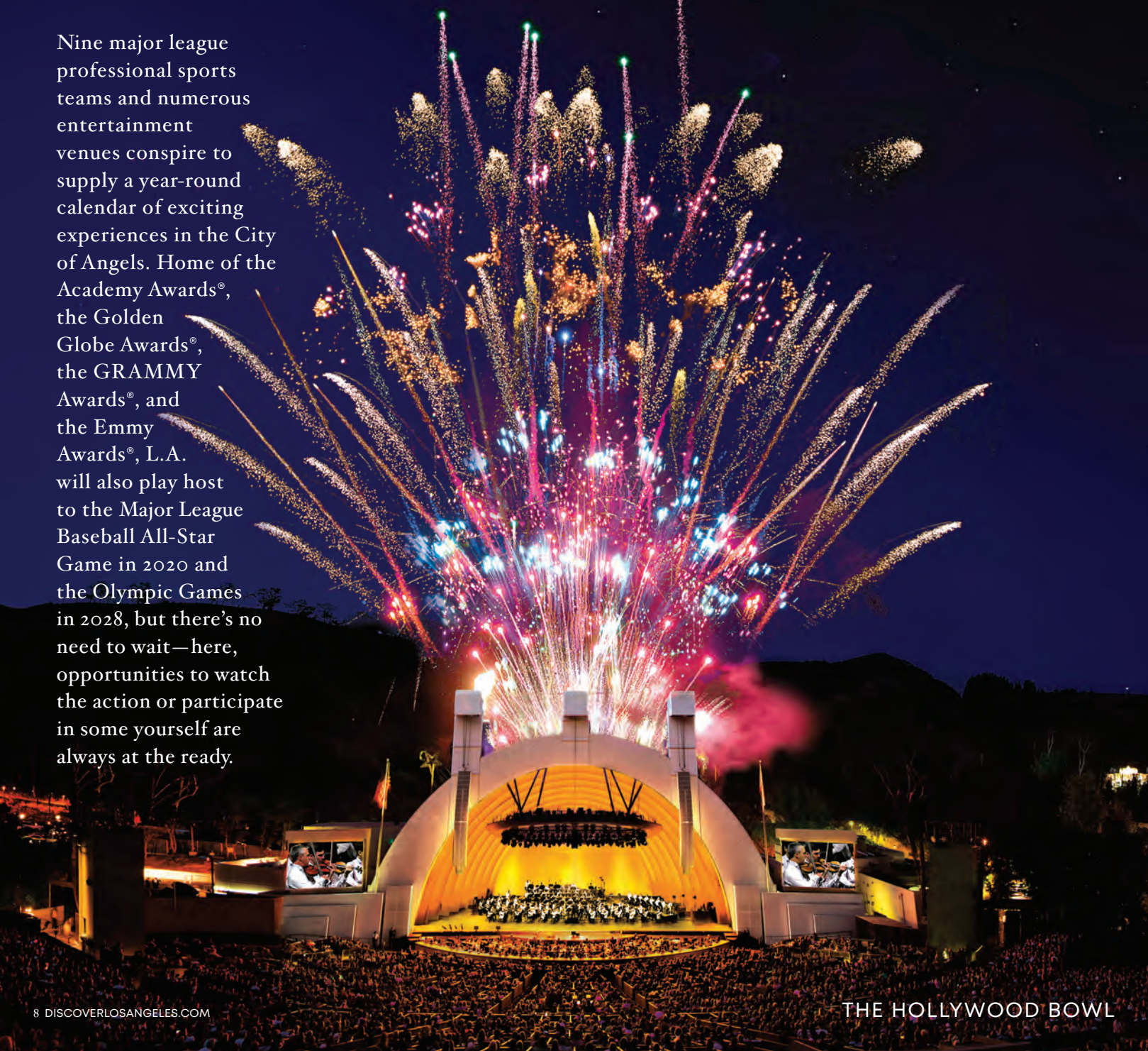
THE HOLLYWOOD BOWL

Nine major league professional sports teams and numerous entertainment venues conspire to supply a year-round calendar of exciting experiences in the City of Angels. Home of the Academy Awards®, the Golden Globe Awards®, the GRAMMY Awards®, and the Emmy Awards®, L.A. will also play host to the Major League Baseball All-Star Game in 2020 and the Olympic Games in 2028, but there's no need to wait—here, opportunities to watch the action or participate in some yourself are always at the ready.