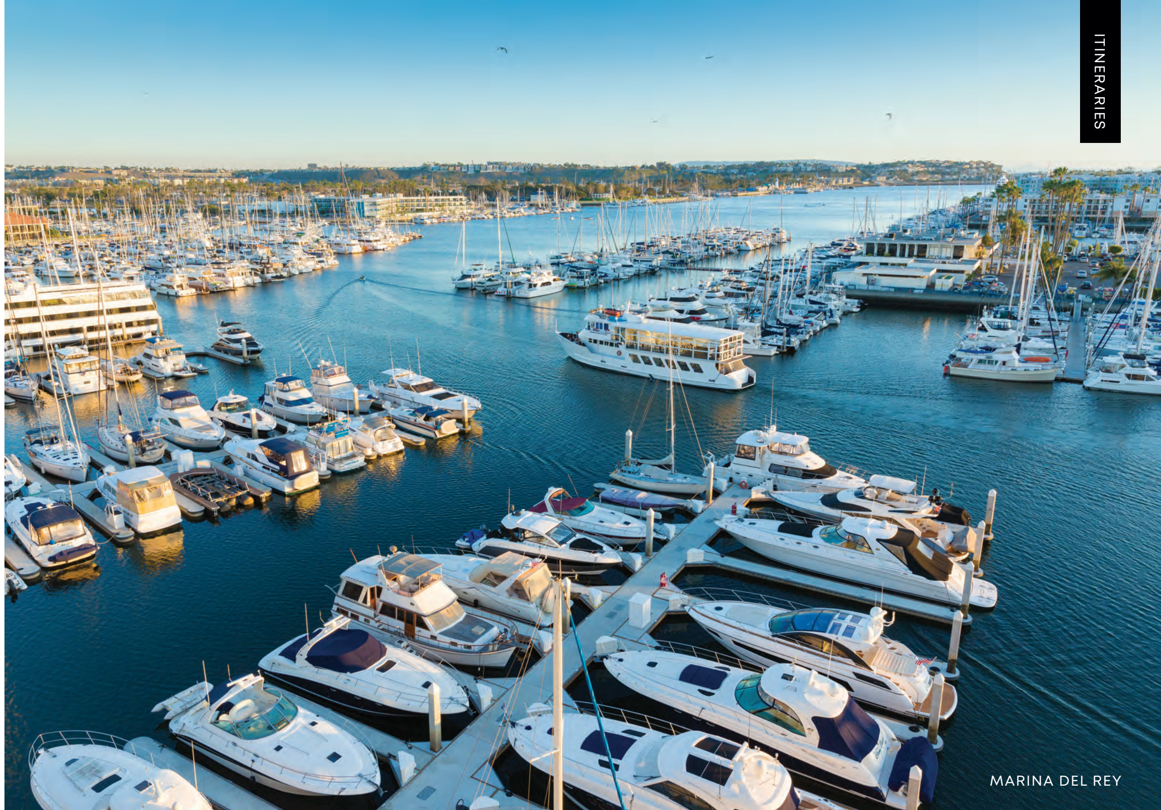
MARINA DEL REY