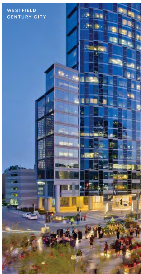
WESTFIELD CENTURY CITY