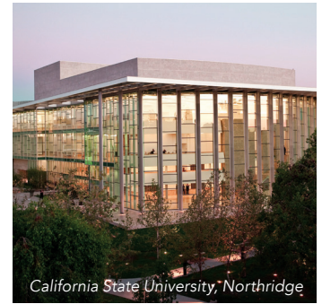
California State University, Northridge