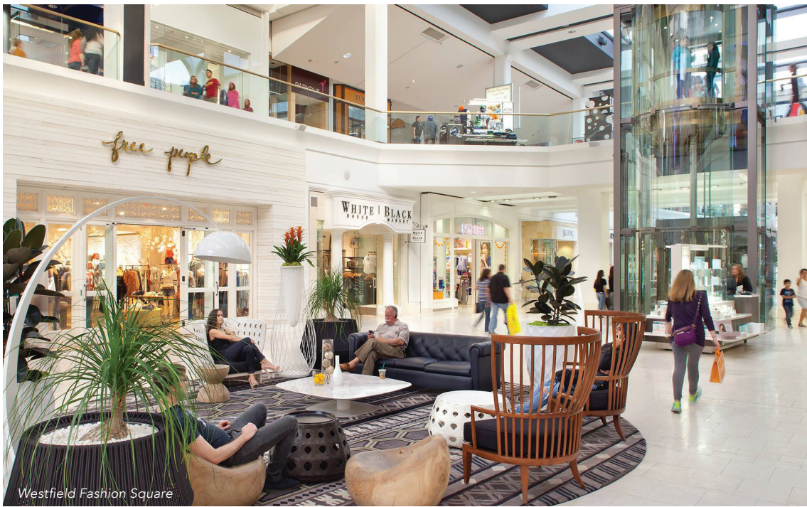
Westfield Fashion Square