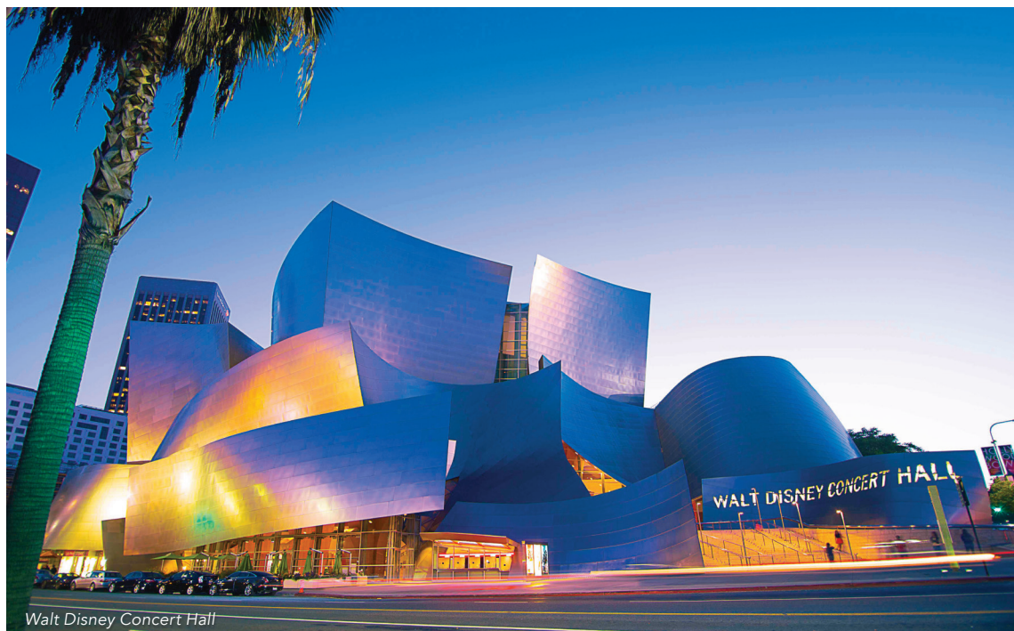
Walt Disney Concert Hall