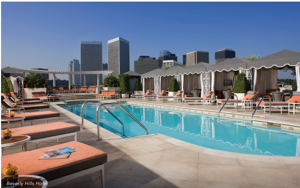
Beverly Hills Hotel