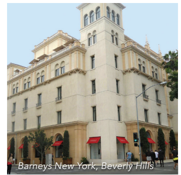
Barneys New York, Beverly Hills